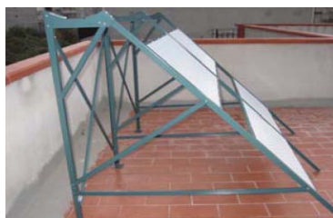
Fit for plane surface