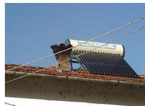
or inclined roof